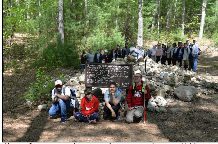
Above: Capstone students pose for a group photo at Walden Pond State Reservation