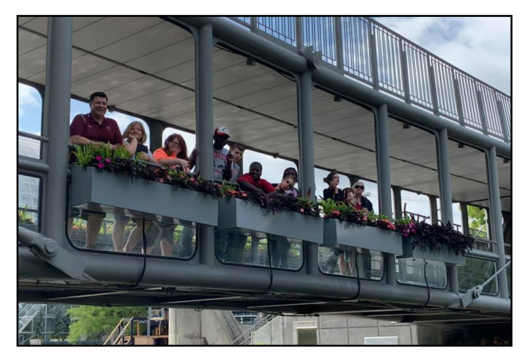
Above: The MSB Mules pose on a bridge in Myriad Botanical Gardens in Oklahoma City

The MSB Mules were honored to have attended the National Convention, and even placed 10th in the United States in Club Trading Pin. While in Oklahoma City, the Mules enjoyed the sites and sounds of the city and will always remember their trip to #BetaCon19!