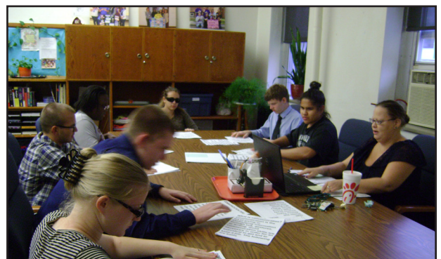
Above: MSB students participate in the weekly job training class under the instruction of RSB career counselors.

The ultimate outcome of this program is to encourage individual growth through work experience to help students reach independence and career satisfaction. The first class of the program has just finished their fifteen-week course, and we at MSB are so excited to watch them reach their true potential and share their progress with you in the coming months!