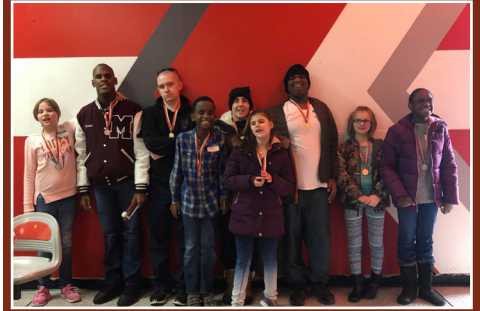
Above: MSB Intramural Sports Team pose with their medals at the Special Olympics Bowling Tournament on January 17. Each member won either 1st, 2nd or 3rd place in their tournament category