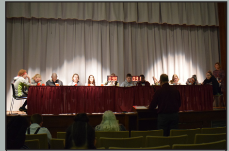
Above: Students in the QuizBowl Finals