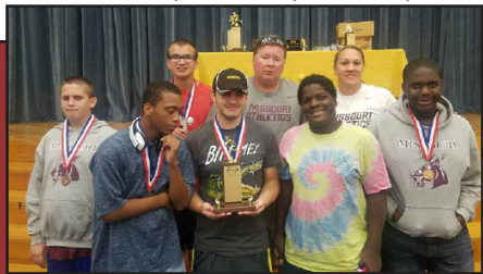
Above: The MSB Boys Track Team and their 3rd Place trophy

Boys scores: AR 219; TN 160; MO 98; KY 76; IN 67.5; IL 62; OH 47; WI 14.5; KS 7.