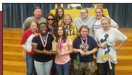
Above: The MSB Girls Track Team and their 1st Place trophy