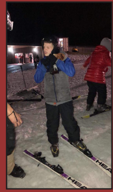
Above & below: MSB students & staff enjoy snow skiing adventures at Hidden Valley Ski Resort in Eureka, Mo.