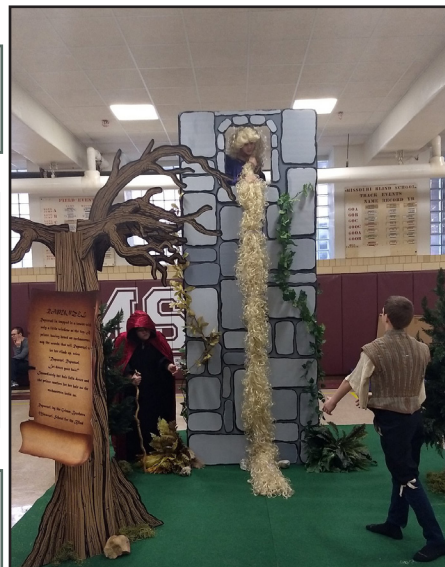
Above: MSB Jr. Beta strikes a pose for "Living Literature" contest, reenacting a scene from "Rapunzel"