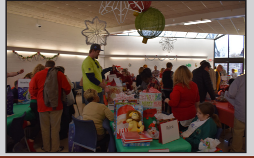
Left: Mules and guests gather in the decorated multipurpose room for gift giving and refreshments

On Wednesday, December 18, MSB Residential students celebrated the holiday season with members of the Meramec-Arnold Elks Lodge. To begin the evening, the Mules and Elks were treated to Christmas carols sung by the Tower Grove Singers choir. After that, the Mules put on a holiday variety show consisting of singing, music played by members of the MSB Rock Band, and skits. After the show everyone enjoyed a delicious dinner of St. Louis-style barbecue and had a special visit with Santa Claus. Thank you to everyone who helped the Mules make the holidays the most wonderful time of the year!