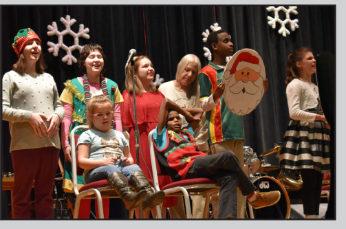
Right: The middle and high school choir performs a song in the Christmas Extravaganza musical program

Right: The elementary choir performs a song in the Christmas Extravaganza musical program